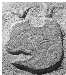
Fig. 2. Detail of stair block in Anonal.

K'AK'-TI' k'ahk' ti' “fire-mouth” “anger”