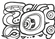
Fig. 6. Detail of Acanceh Vase. Drawing by A. W. Voss

'u-K'AK'-HUT? k'ahk' 'uhut fire 3SE-eye/face “fire (is) his face/eye” “he (is) ireful”