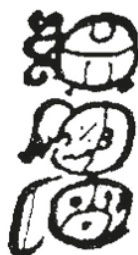
Fig. 1. Detail of K1652 Vase [Grube N., Nahm W., 1993]

K'AK'-'OL-la k'ahk' 'ohl “fire-heart” “anger”