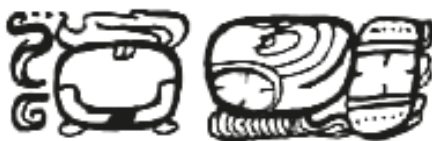
Fig. 4. Detail of Taxin Chan Plate. Drawing by G. Krempel

K'AK'-yo-'OL-la k'ahk' yohl fire 3SE-heart “fire (is) his heart” “he (is) ireful”