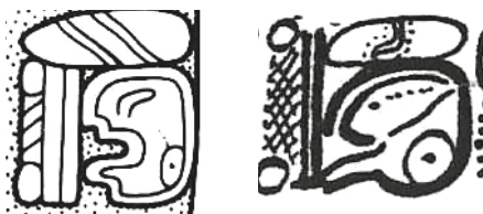
Fig. 3. Details of Naranjo Stela 19 and K635 (composition elaborated by: [Houston S., 2016, fig. 4])

TOK'-TI' took' ti' “flint-mouth” “anger”