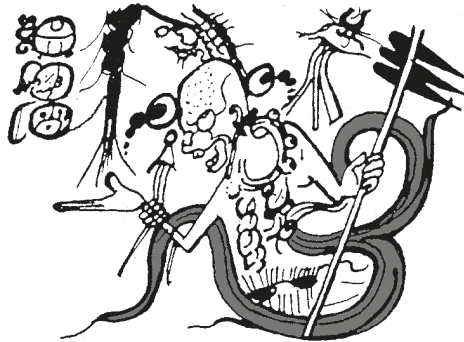
Fig. 9. Detail of K1652 Vase [Grube N., Nahm W., 1993; with color modifications by A. Sheseña to give emphasis]

The latter case is notable since the translation of the name of the wahyis leads us to wonder if the adjacent image that depicts him (Fig. 9) is not really a representation of the linguistic metonym-metaphor that expresses the anger characteristic of this supernatural entity 34 . Other examples that also seem to depict representations of linguistic metonyms and metaphors of anger are found in the image of the anthropomorphous deer with fire emerging from its snout in El Baúl Monument 14, and in the central face of the famous Aztec calendar stone that depicts a knife emerging from its mouth, among several other examples 35 .