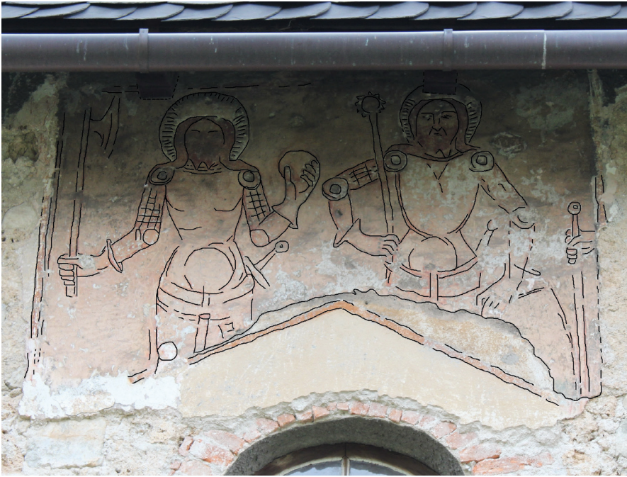
Fig. 4. St. Ladislav, St. Stephen (and St. Emeric), c. 1400, drawing on the holy kings' representation, fresco, southern exterior wall of the sanctuary (Calvinist (formerly Catholic) Church (of the Holy Virgin and St. George), Plešivec). Photo & Drawing: D. Gh. Năstăsoiu