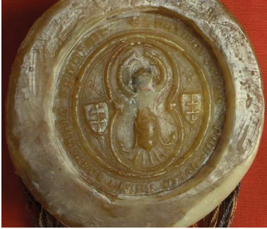
Fig. 7. Impression of the seal of the Palatine of Hungary Detre Bebek, 1399, wax, diameter 5.5 cm (Hungarian National Archives). URL: https://archives.hungaricana.hu/hu/charters/59395/

the images of the sancti reges Hungariae . This, of course, did not eliminate their high personal devotion towards St. Ladislav, St. Stephen, and St. Emeric.