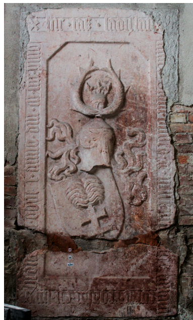
Fig. 6. Tomb Slab of Ladislav Bebek, 1401, red marble, 231 × 117 cm, northern chapel (Calvinist (formerly Catholic) Church (of the Holy Virgin and St. George), Plešivec).