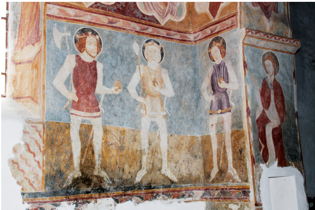
Fig. 3. Sts Ladislas, Stephen, and Emeric ( sancti reges Hungariae ), 1390s, fresco, southern side of the sanctuary (Roman Catholic Church of the Holy Trinity, Rákoš).

settlement's location in the proximity of St. Ladislas' cult center in Nagyvárad, but also by the settlement's ownership. Starting with 1318 and until around the mid-15 th century, the settlement in Remetea was mentioned in written sources as part of the estate of the Bishops of Nagyvárad 33 . They were the main promoters of the holy king's cult, whereas Bishop Lukás Szántai himself was an active participant in the anti-Sigismund rebellion.