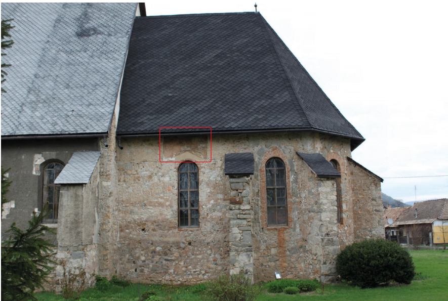
Fig. 5. View of the southern wall of the sanctuary with marking of the location of the holy kings' scene, c. 1400 (Calvinist (formerly Catholic) Church (of the Holy Virgin and St. George), Plešivec). Photo & Drawing: D. Gh. Năstăsoiu