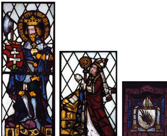
Fig. 2. St. Ladislav, Archbishop of Esztergom John Kanizsai, and the Kanizsai's coat of arms, 1416, stained glass, 123 × 48 cm, 74.5 × 48 cm, and 45 × 45 cm (Church of the Former Carthusian Monastery St. Margaretenthal, Basel) [Szentmártoni Szábó G., 2011]

Archbishop John Kanizsai's personal devotion towards St. Ladislav did not cease even after his anti-Sigismund conspiracy failed, and he reconciled with the king playing again subsequently an important role in the kingdom's political and diplomatic affairs. This is illustrated by one of the archbishop's artistic and pious commissions happening most likely during the summer of 1416, when John Kanizsai was attested in Basel 25 . While being there, the archbishop ordered for the church of the former Carthusian monastery a series of stained-glass windows to decorate the area of the church's spiral stairs 26 (Fig. 2). Varying in size, the three stained glasses display the archbishop's coat of arms and his image as a donor praying to St. Ladislav 27 . Having his halo inscribed as Ladislavus rex ungarie , the crowned holy knight holds a globus cruciger, his usual battle-axe attribute, and a red